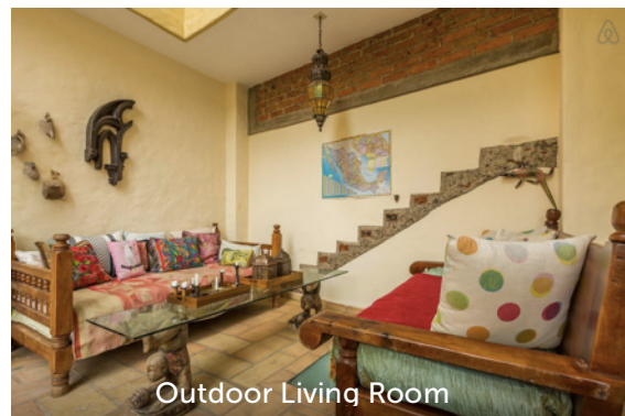
Outdoor Living Room