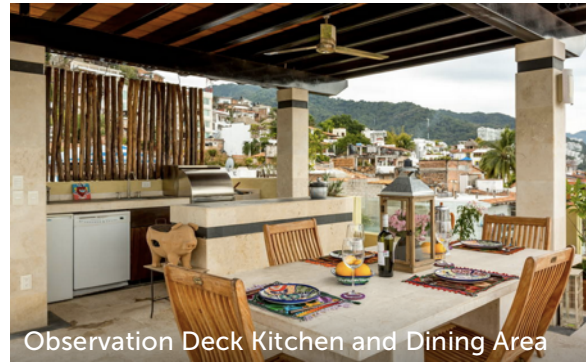
Observation Deck Kitchen and Dining Area