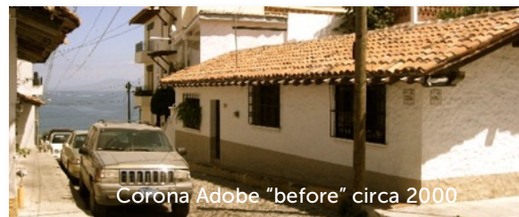
Corona Adobe "before" circa 2000