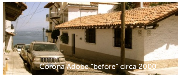
Corona Adobe "before" circa 2000